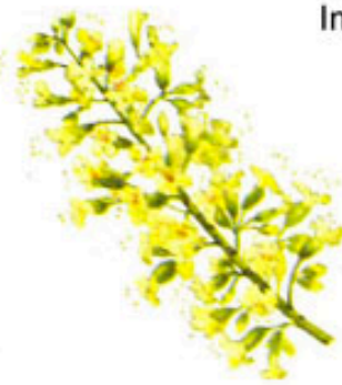
Thyrsse Aesculus hippocastanum