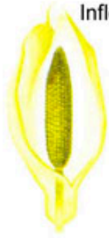
Spadix Arum sp