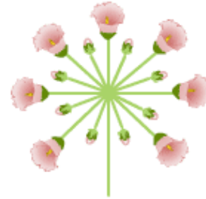
ombelle simple sphérique