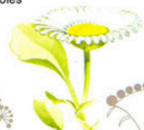
Capitule Bellis perennis