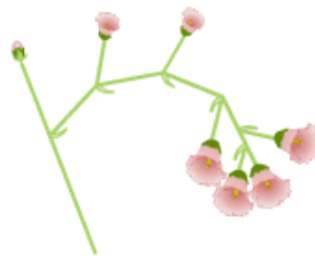
cyme unipare scorpidé