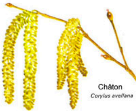
Châton Corylus avellana