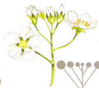
Corymbe Prunus mahaleb