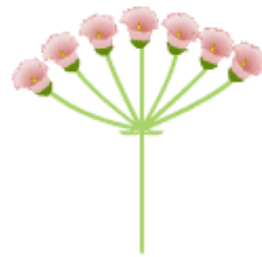
ombelle simple convexe