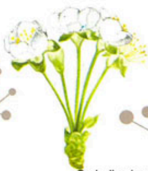
Ombelle simple Prunus cerasus