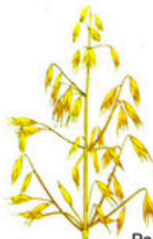
Panicule Hordeum vulgare