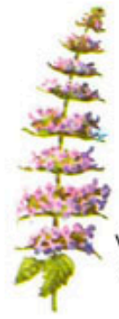
Verticillaster Mentha sp