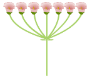
ombelle simple aplatie