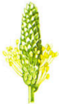
Epi Plantago sp